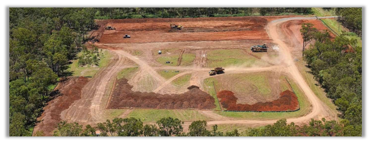
PPF Site – looking south

Looking west showing PPF site clearance complete (foreground), Orica (midground) and Rio Tinto Aluminium (background)