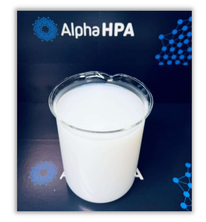
Sol-gel formation from high dispersible boehmite

High dispersible boehmites are used in sol-gel applications in the manufacture of high value, speciality aluminas, including nano-aluminas and alumina for translucent ceramics.