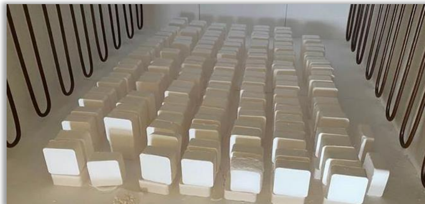
Sintering of HPA pellets for sapphire glass manufacture

In December 2020, Alpha completed the successful delivery of 96kg of sintered pellets to AIOx technology ('AIOx'). AIOx then subsequently grew a ~90kg sapphire boule that was successfully wafered and qualified for optical applications. Building from this testwork, Alpha is currently manufacturing a 20kg sample order of bespoke, high density HPA pellets for a large Japan based ceramics and sapphire glass manufacturer.