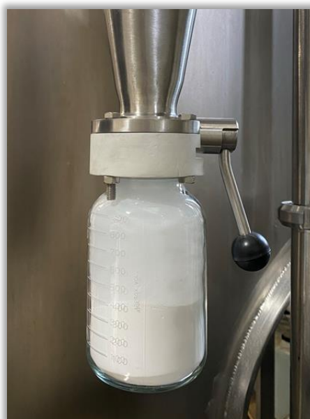
High purity boehmite in production