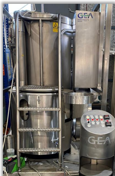
Boehmite spray dryer

Based on the Company's market research, Alpha HPA is not aware of any commercial boehmite products of equivalent purity. X-ray diffraction (XRD) analysis and scanning electron microscope (SEM) analysis confirmed 100% crystalline boehmite.