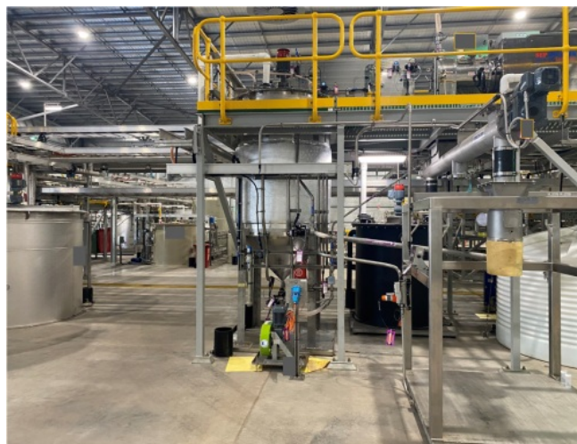
Figure 4: Installed crystalliser