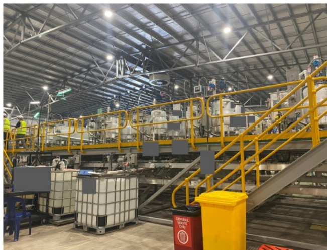
Figure 3: Solvent extraction circuit