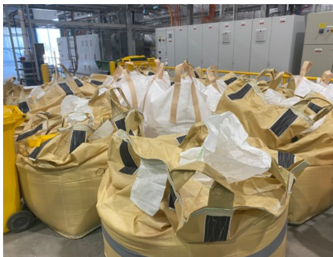
Figure 1: Aluminium feedstock (~17ktpa) received from Rio Tinto

The Apr'22 award of Federal Government grant funding of A$15.5m under the Critical Minerals Development Program (CMDP) will cover additional capex for both expanded Al-sulphate production capacity (for total nominal precursor production capacity of ~400tpa) and high purity alumina and boehmite circuits within the Stage 1 PPF (nominal capacity of ~10tpa each). We estimate cumulative capex spend of A$35m to date against total Stage 1 PPF capex requirements of A$51m.