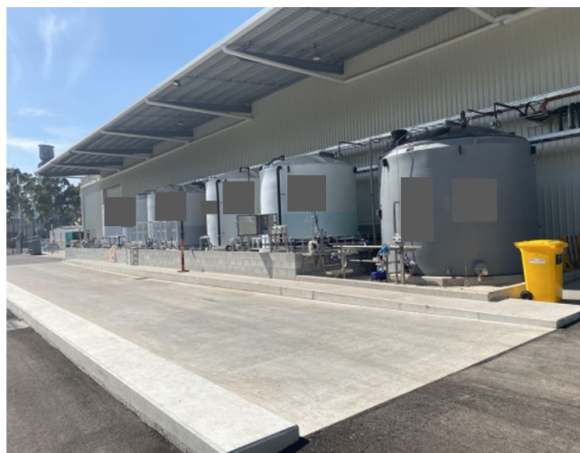
Figure 2: Orica process reagent delivery and storage area